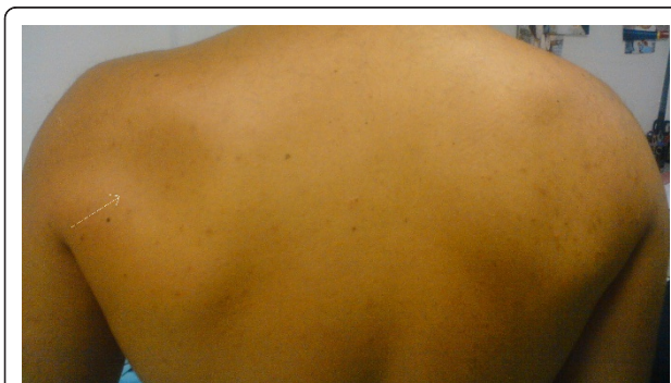
Figure 1 A picture of both shoulders from the back showing muscle atrophy on the left side (arrow) obtained at the patient's six-month follow-up examination.

Routine MRI of the shoulder was done using a 3-Tesla scanner three months following the patient's the initial symptoms. A series of T2-weighted/turbo spin echo fat suppression oblique coronal, oblique sagittal, axial T2-weighted/turbo spin echo oblique sagittal, proton density fat suppression, and T2-weighted/gradient echo axial imaging slices through the left shoulder were obtained using a phased array dedicated shoulder coil. These MRI scans showed diffuse high signal intensity within the supraspinatus and infraspinatus muscles on the T2-weighted/turbo spin echo fat suppression images and early signs of minimal fatty infiltration consistent with denervation changes. In addition, no compression of the suprascapular nerve in the suprascapular or spinoglenoid notch and no denervation changes of the teres minor muscle or subscapularis muscle were seen. The MRI findings are presented in Figures 2A and 2B. Following these MRI findings, the patient was referred for electromyography (EMG). EMG showed active denervation effects in the supraspinatus muscle and more prominent denervation effects in the left infraspinatus muscle, which were compatible with damage to the suprascapular nerve, especially the part supplying the infraspinatus muscle. The nerve conduction to the